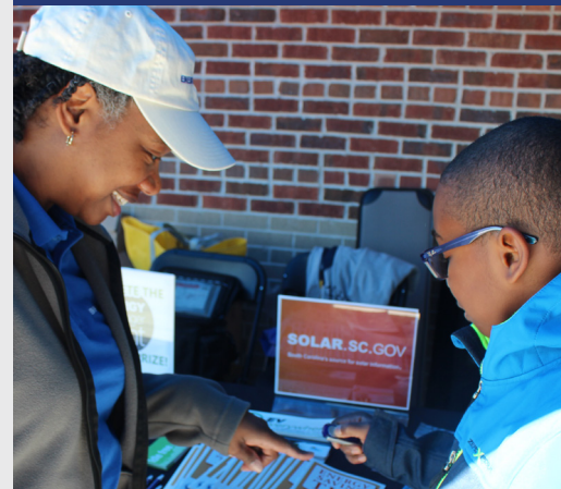
ORS Energy Office staff member discusses energy efficiency with a student at a local STEAM Festival.