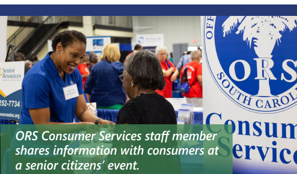
ORS Consumer Services staff member shares information with consumers at a senior citizens' event.

The ORS serves as a mediator between consumers and utilities in South Carolina, as well as between consumers and the electric cooperatives. Consumer Services resolves a vast majority of complaints through an informal investigation process, avoiding a more costly formal hearing at the PSC. Through consumer education, Consumer Services helps consumers make educated choices and understand their rights and obligations.