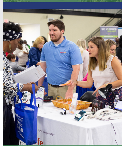
ORS Telecommunications staff members share information with a consumer.